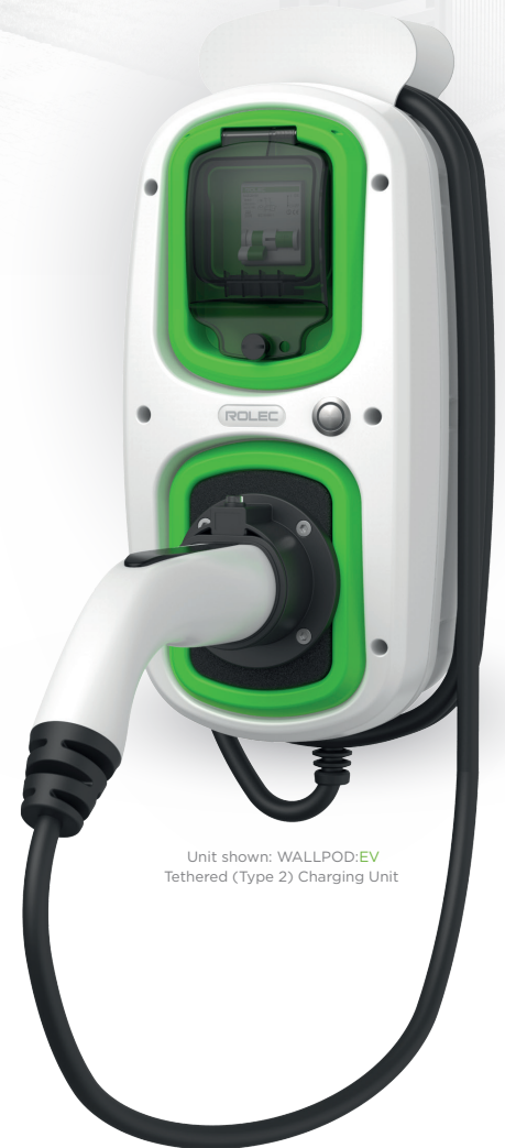
Unit shown: WALLPOD:EV Tethered (Type 2) Charging Unit

The WALLPOD:EV is a low-cost, entry level charging unit, designed to offer full Mode 3 fast charging to every Electric Vehicle (EV/PHEV) on the market today.