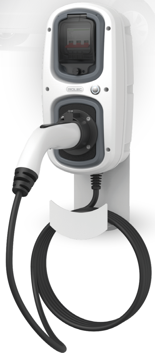
Unit shown: WALLPOD:EV SUPERFAST Tethered (Type 2) Charging Unit