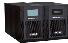
Battery Cabinets. (Optional)