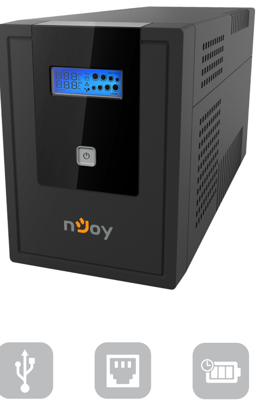
HID USB port